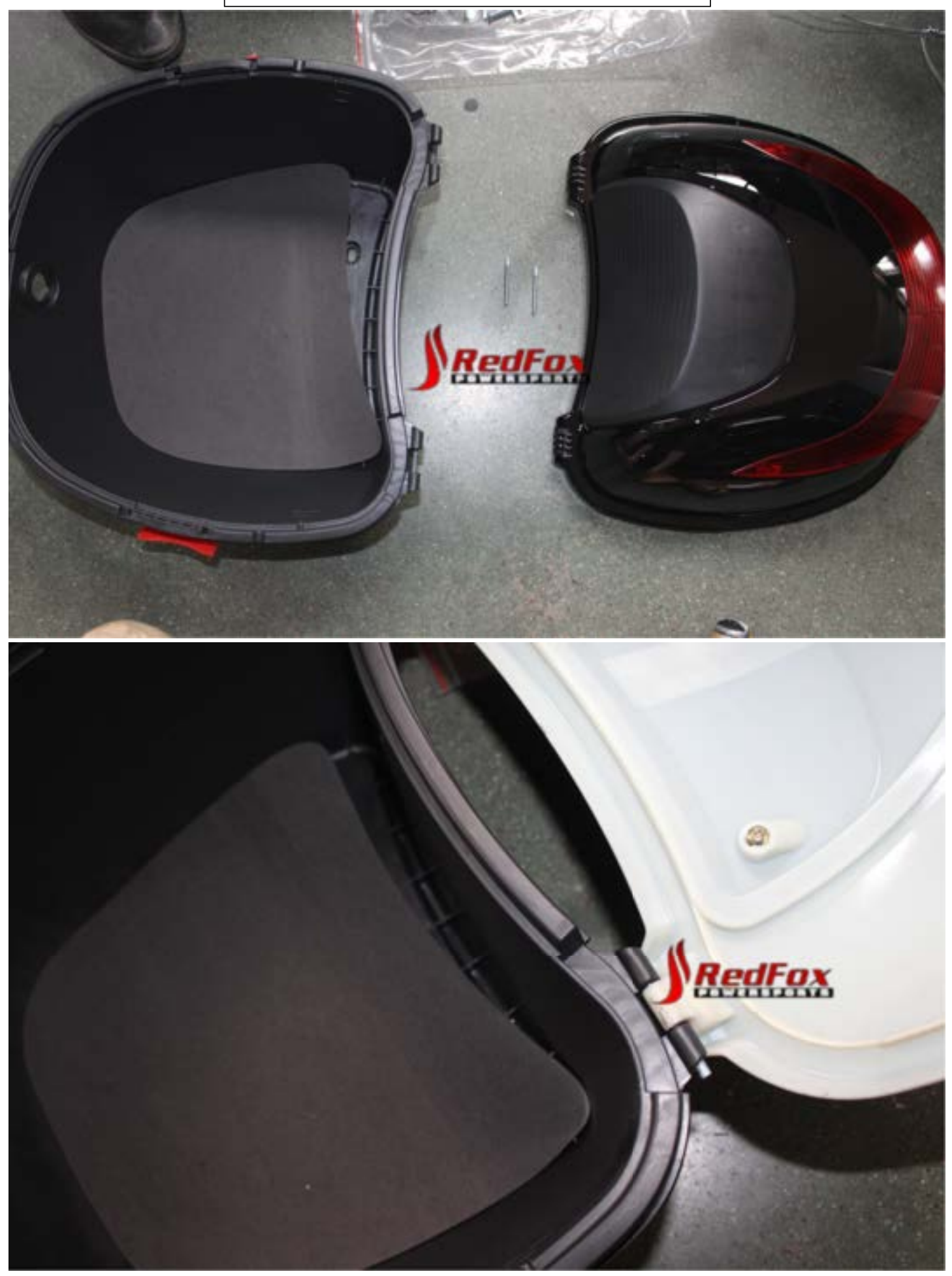
Tips: use a pin size tool and a hammer to properly insert the pin full way