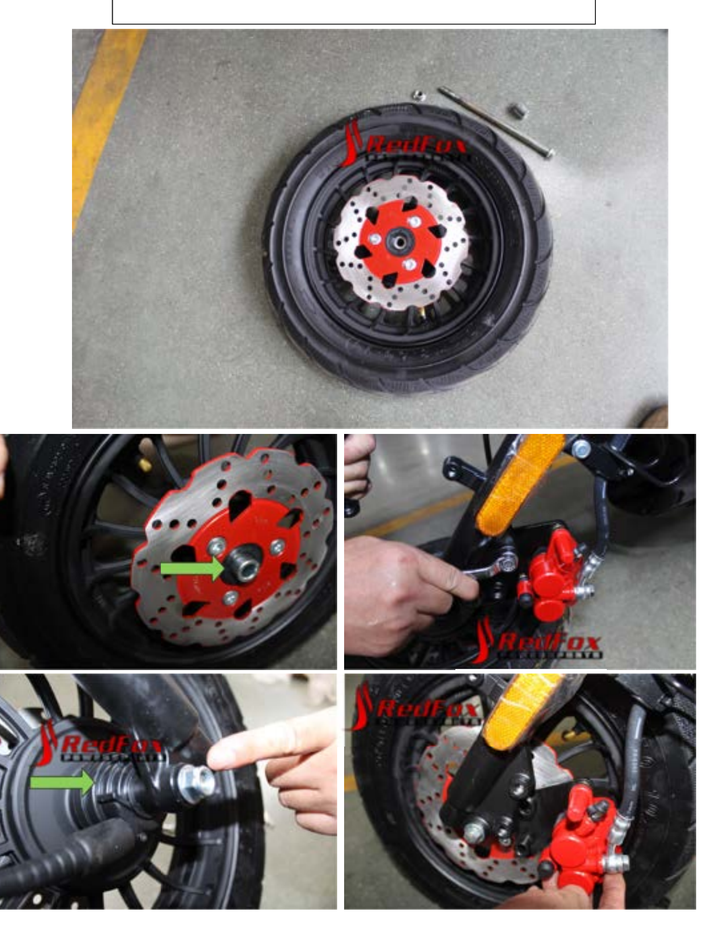
Tip: Remove brake caliper for easier installation on the front wheel, insert brake caliper after wheel is properly installed