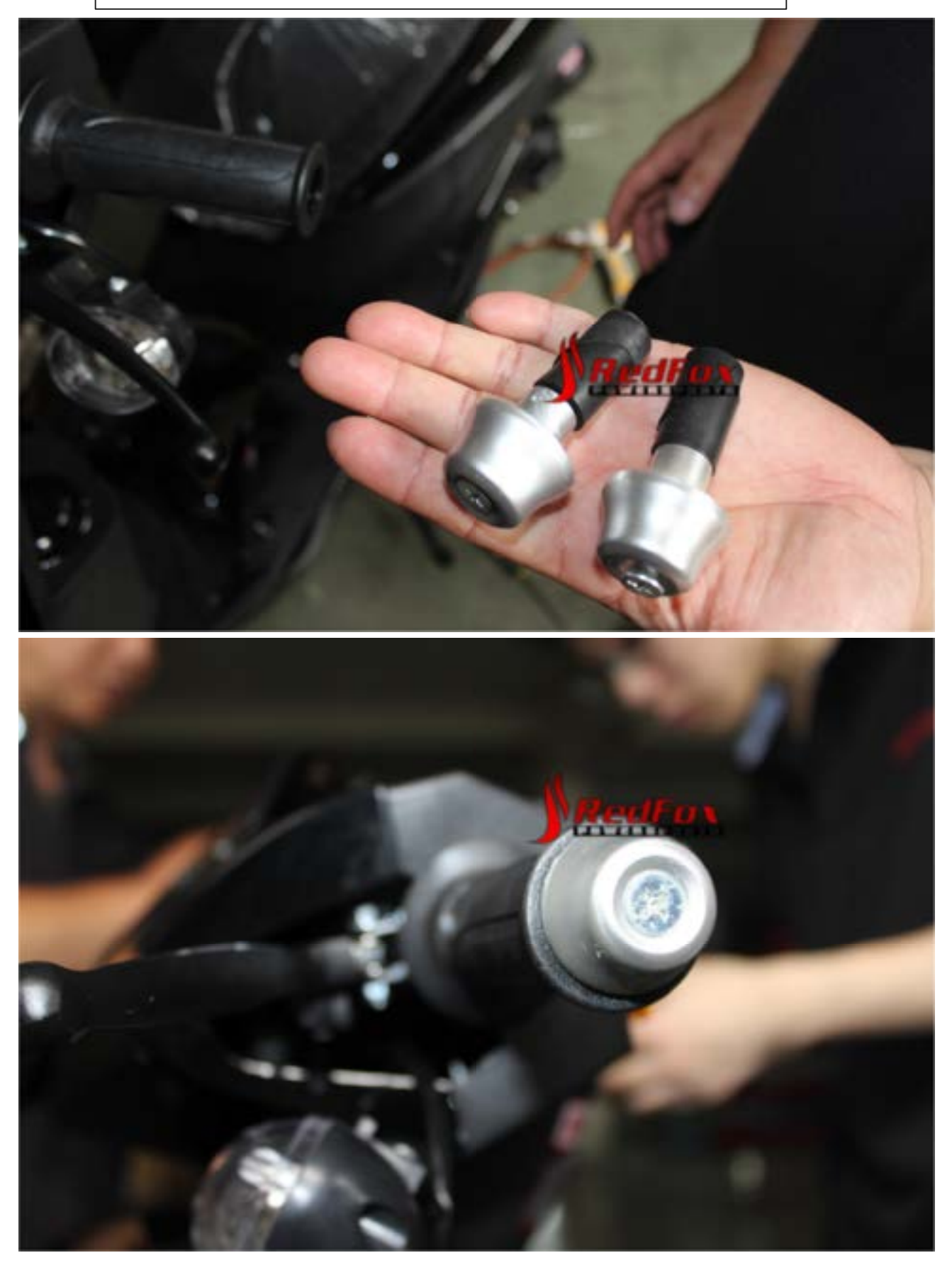
tips: Push the handle bar in hard to engage and screw it the end screw to tighten it