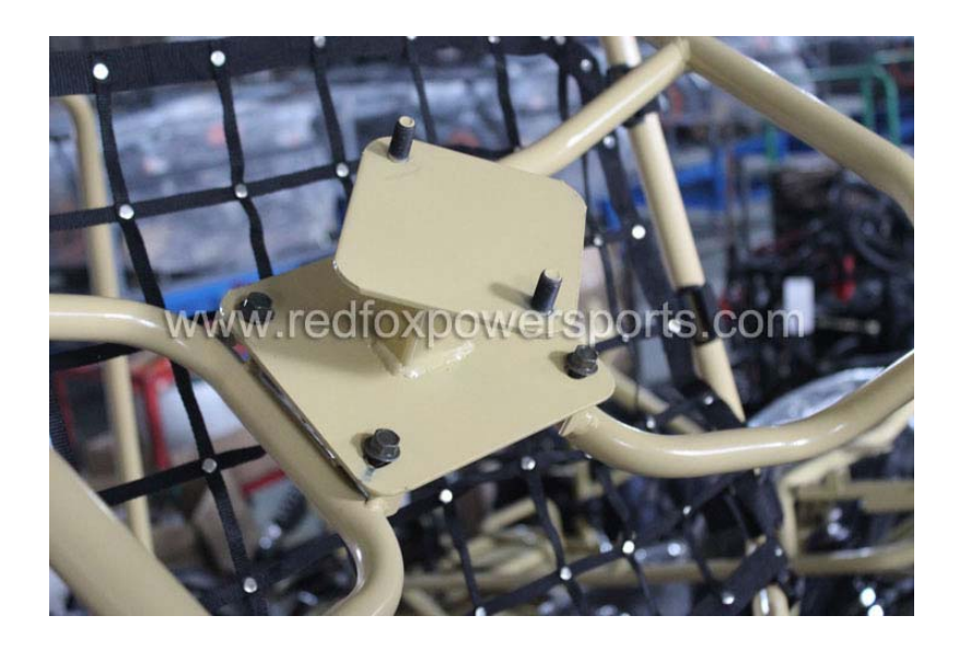
16. Install Roof