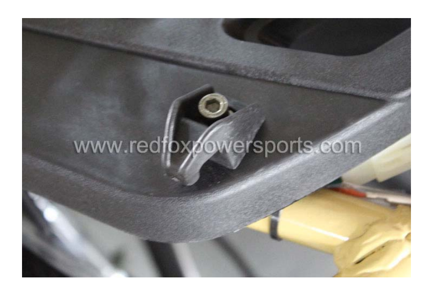
15. Install Spare tire Rack